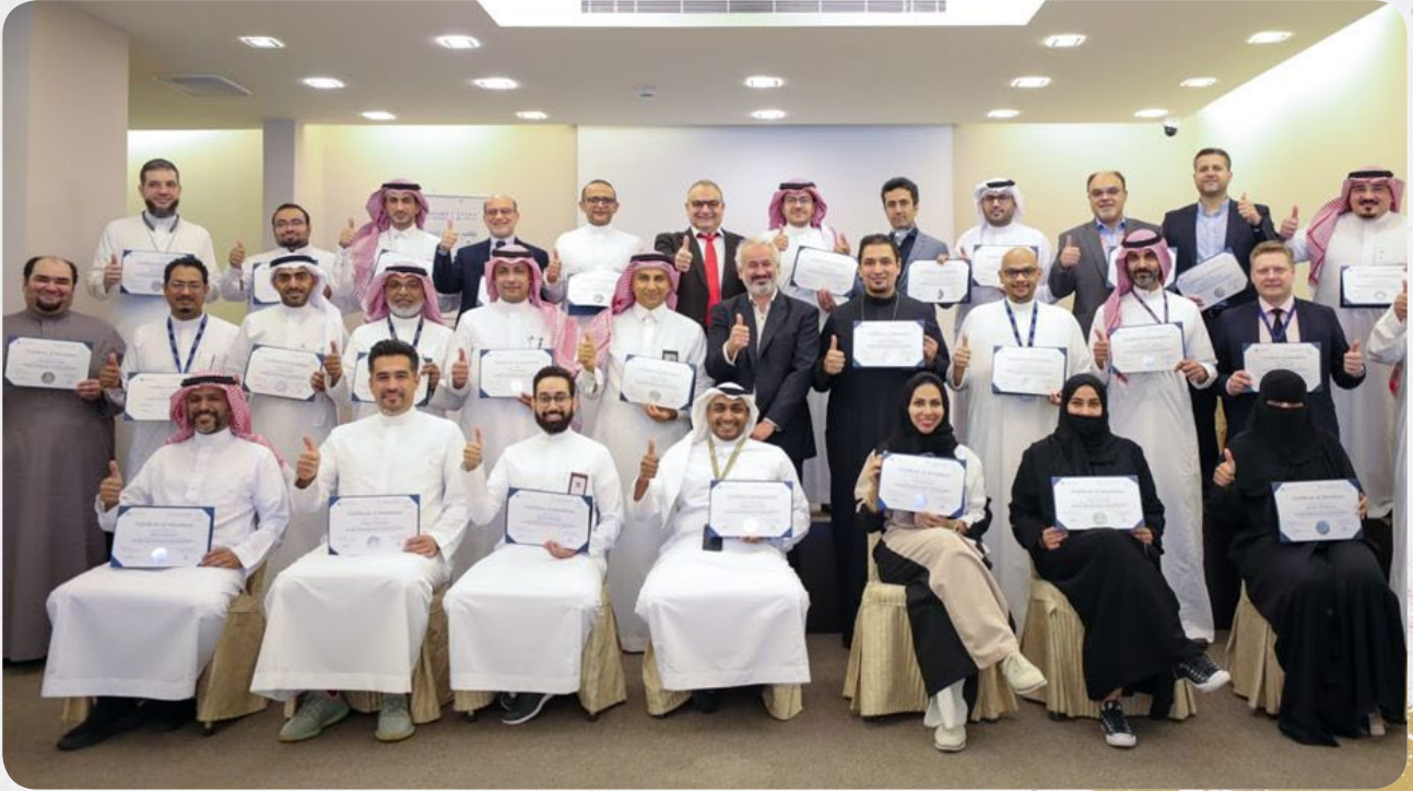
Picture taken from a series of knowledge-transfer Workshops - 2022 (Jeddah, KSA)