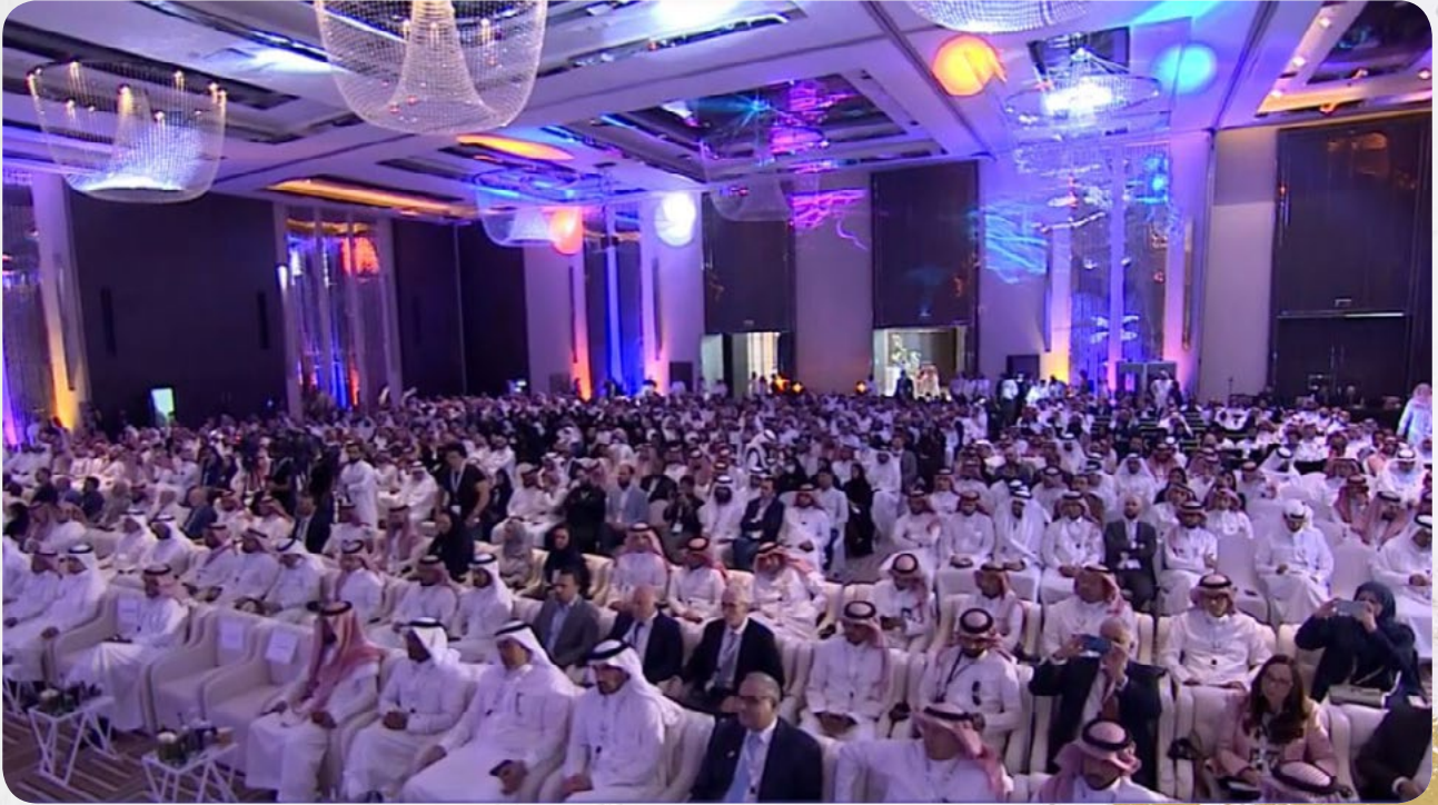
GPMF 2022 Opening Ceremony at Fairmont, Riyadh