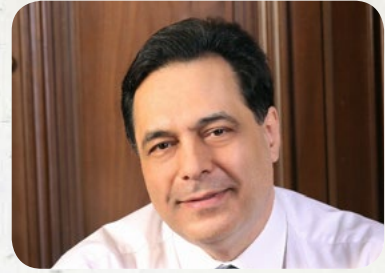
HE Prof. Hassan Diab